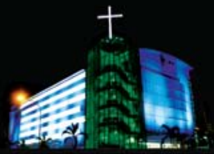
lighthouse evangelism woodlands

swordlight (bible study) Every Monday 2.00 pm & 8.00 pm