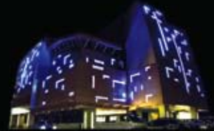
lighthouse evangelism tampines

1 Tampines Street 82 Singapore 528985 Tel: 6788 1323 | 81 Woodlands Circle Singapore 738909 Tel: 6363 6776 E-mail: lighthouse@singnet.com.sg | Websites: www.lighthouse.org.sg | www.ronytan.com