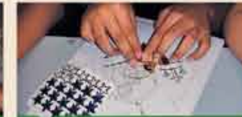
Primary school average-functioning Touchlightee creates a Nativity scene