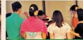
Touchlightees join Touchlighters in weekly pre-service prayer