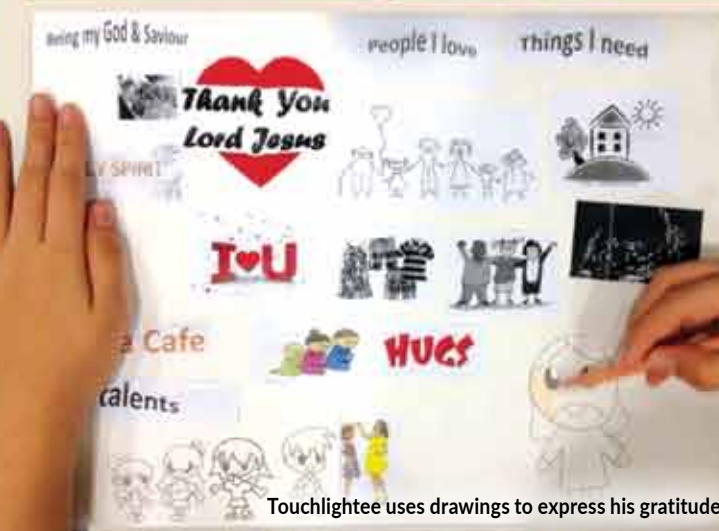
Touchlightee uses drawings to express his gratitude