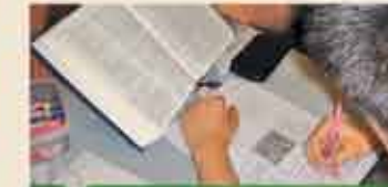
Bible study with mid-functioning and high-functioning teens

Parents, we invite you to bring your children with special needs to Touchlight for praise and worship, lessons, activities and prayer. Please call the church office at 67881323 for more information.