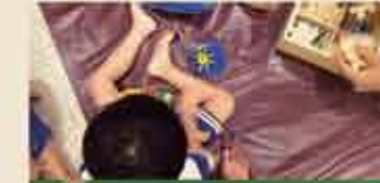
Pre-school Touchlightees engage themselves with puzzles and manipulatives